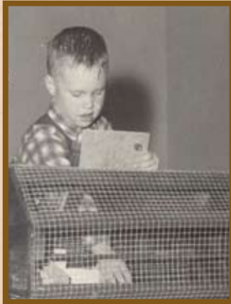
Prize drawings have always been an integral part of Annual Meeting. This photo of a prize drawing was from the 1953 Annual Meeting.

For the last seven decades, Central Alabama Electric Cooperative members have made their voices heard through the power of voting. Each year, the co-op holds an Annual Meeting to allow members to gather, vote and partake in fellowship. The following photos depict some of the many memories formed during the years.