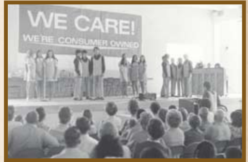
Entertainment has varied from beauty pageants to lamp making contests. Singing groups have taken center stage over the years.