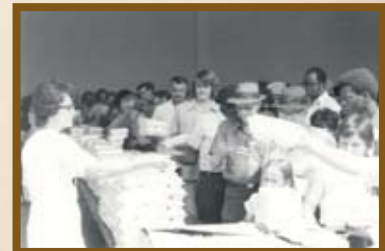
Food choices have ranged from BBQ to hamburgers and hotdogs.