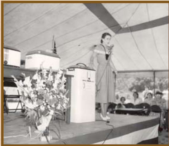
During the first Annual Meetings, attendees learned about appliances through demonstrations.

New appliances, such as refrigerators and electric ovens, were not common place in most CAEC members' homes.