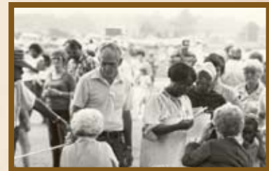
Members arrive for Annual Meeting.

New appliances, such as refrigerators and electric ovens, were not common place in most CAEC members' homes.